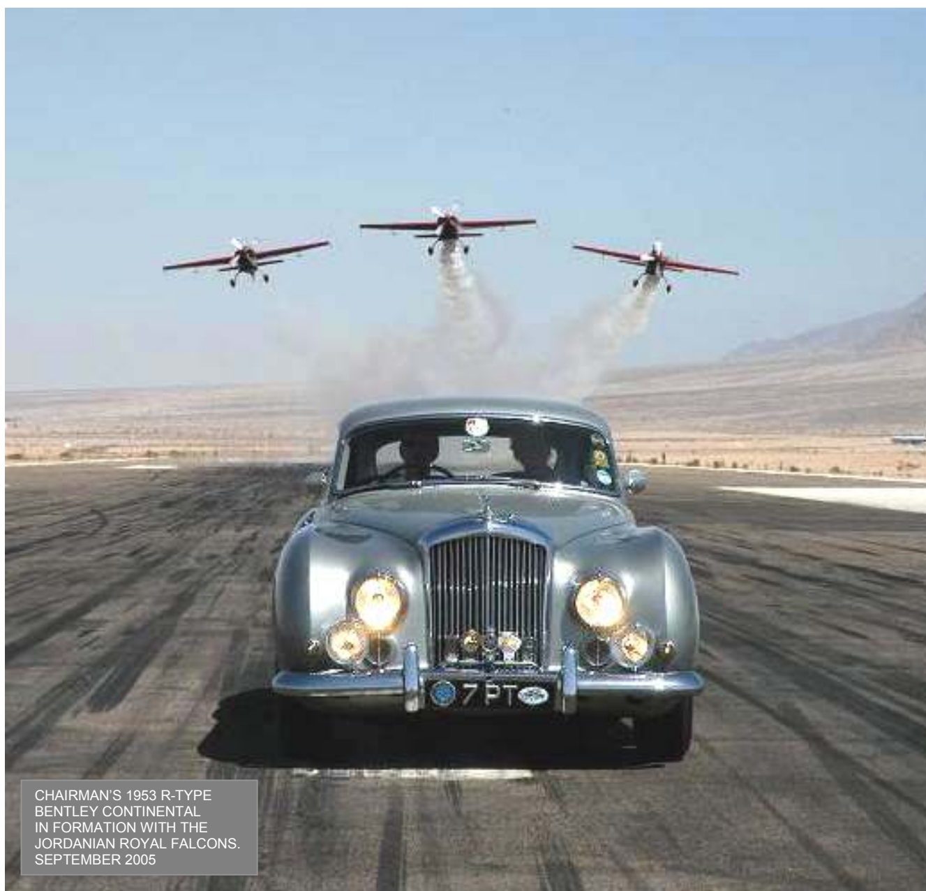
CHAIRMAN'S 1953 R-TYPE BENTLEY CONTINENTAL IN FORMATION WITH THE JORDANIAN ROYAL FALCONS. SEPTEMBER 2005

Breakfast and Daily Briefing Checkout from Aqaba Hotel Depart for Aqaba International Airport